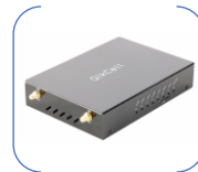
4G ATA Router

All specifications are subject to change without notice | v004